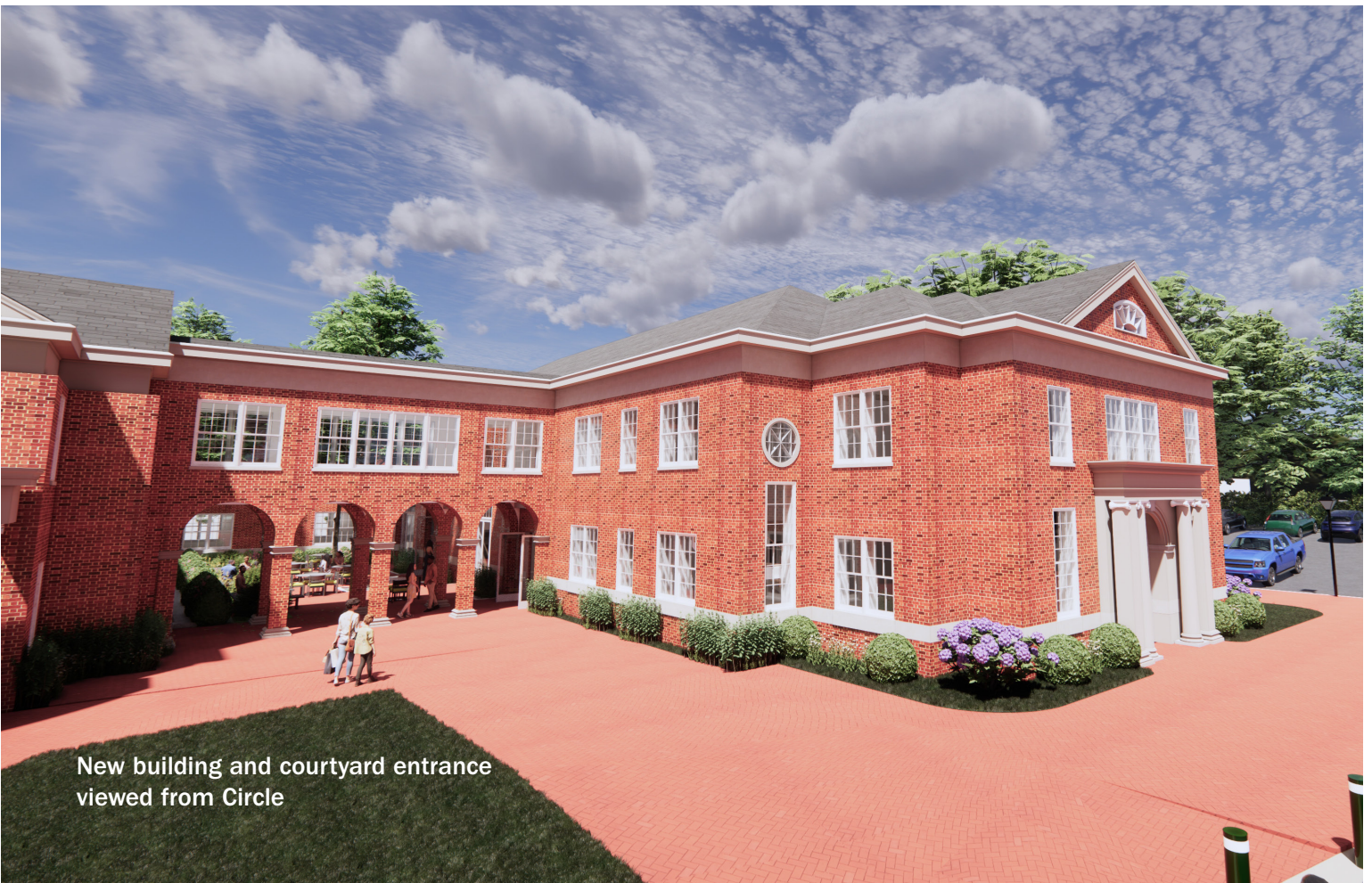
New building and courtyard entrance viewed from Circle