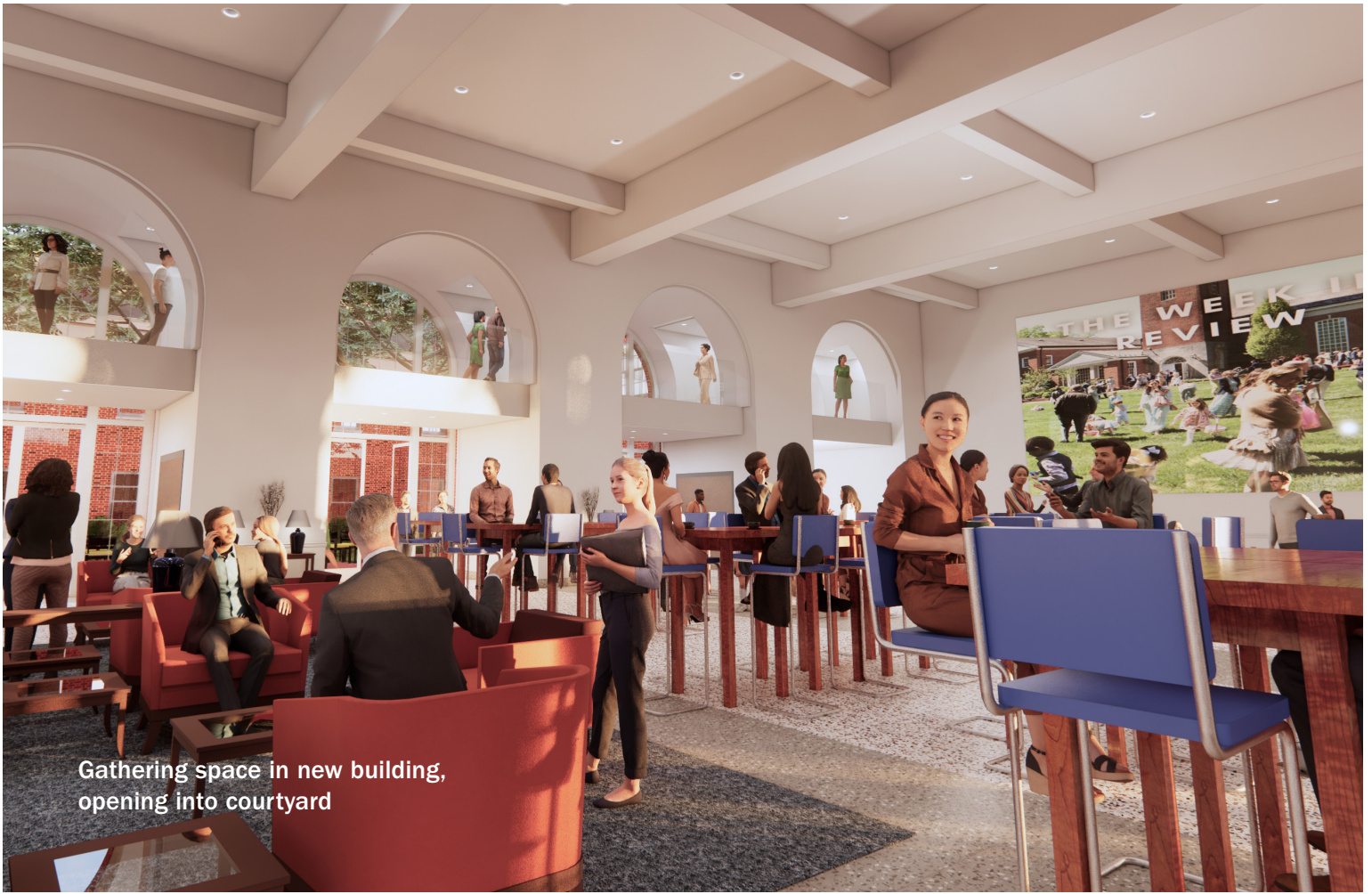
Gathering space in new building, opening into courtyard