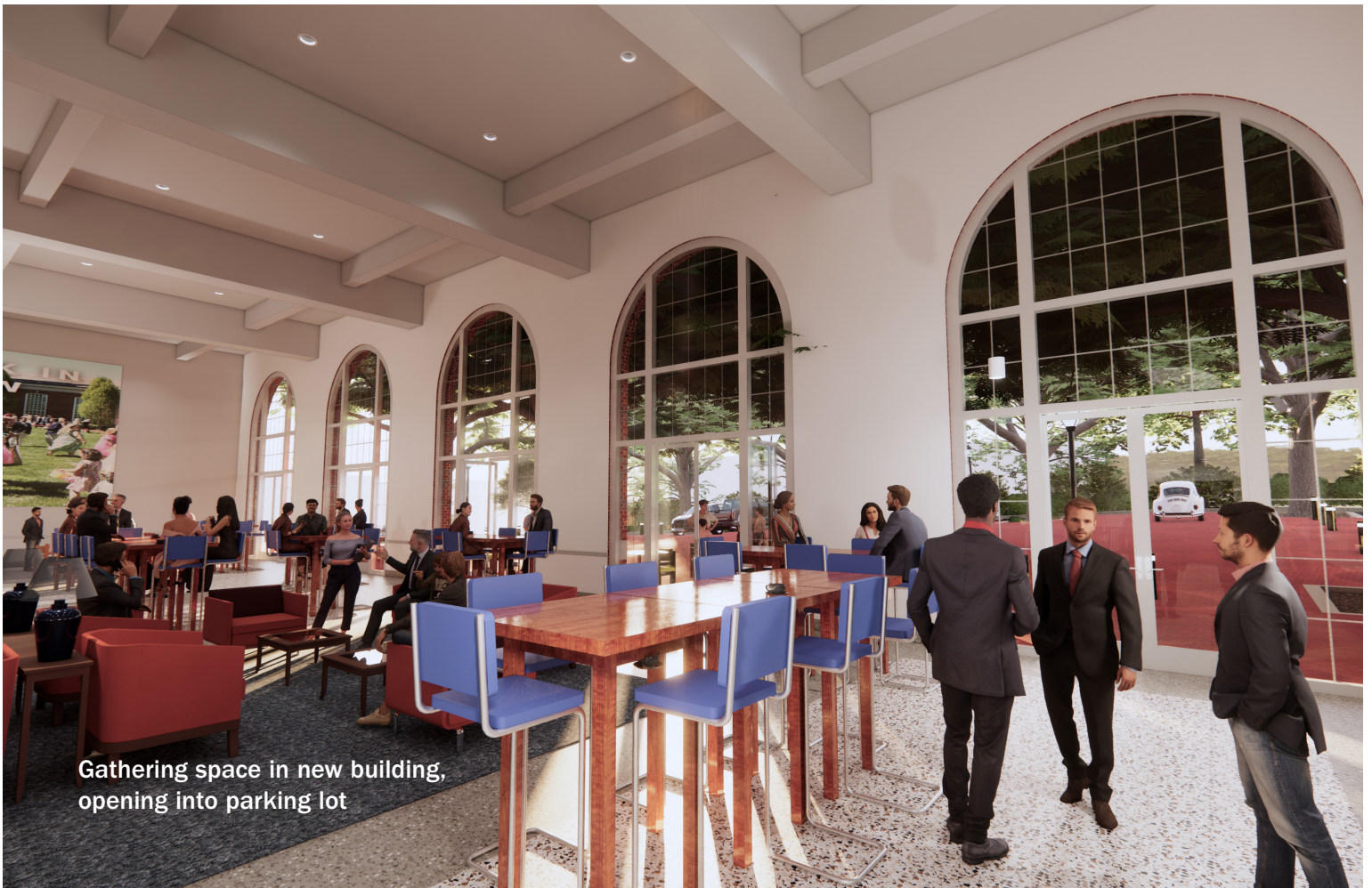
Gathering space in new building, opening into parking lot