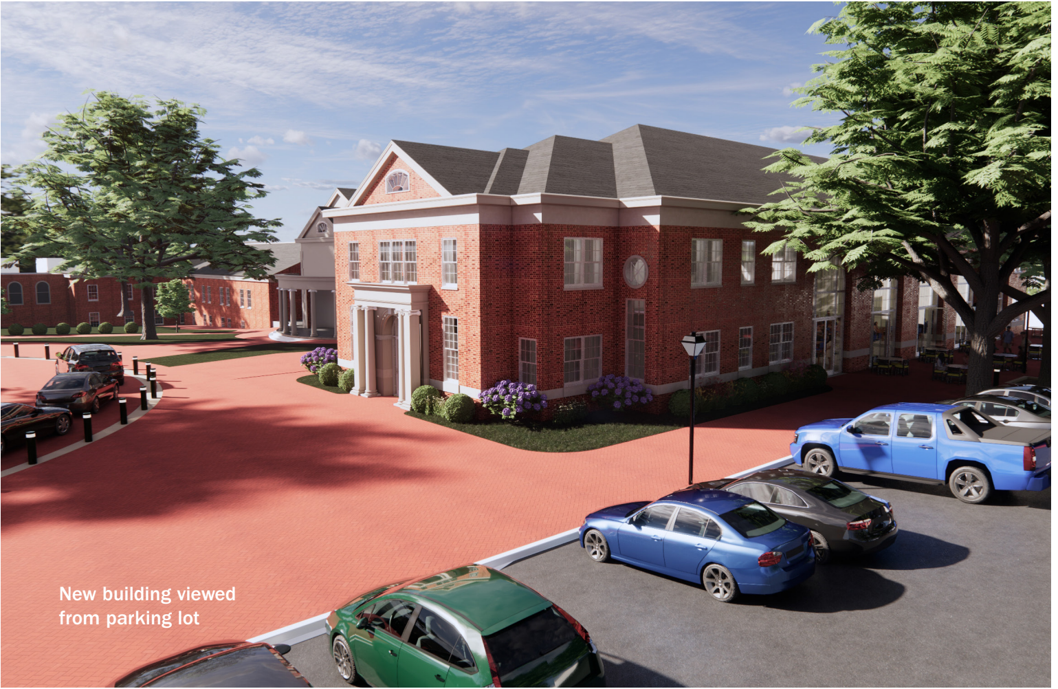
New building viewed from parking lot